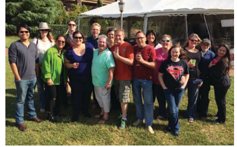
Vanderbilt Dermatology Mohs team across the years, gathering at Pinewood Social, Department Holiday Party, and Arrington Vineyard