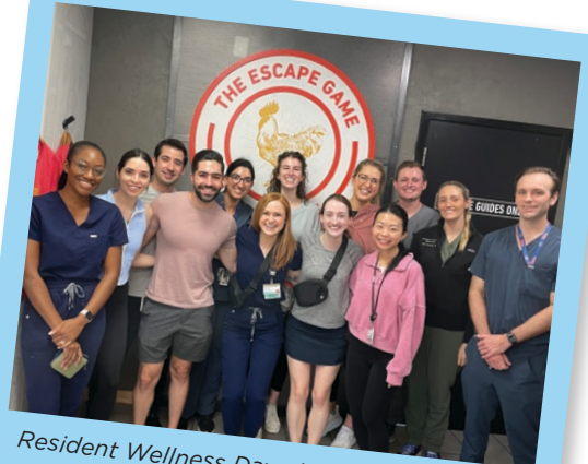
Resident Wellness Day at The Escape Room