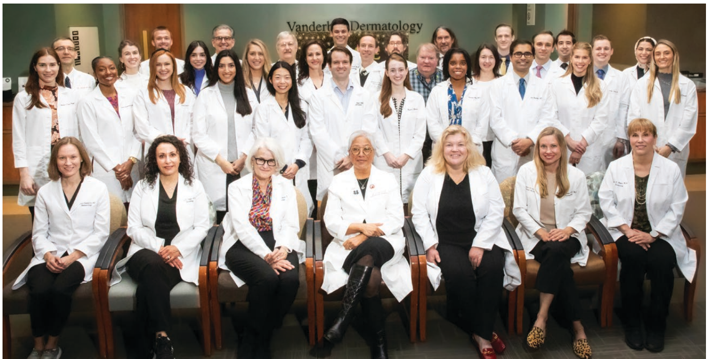
Vanderbilt Dermatology Faculty and House Staff