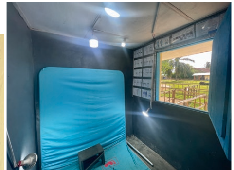
The Kole photography studio.