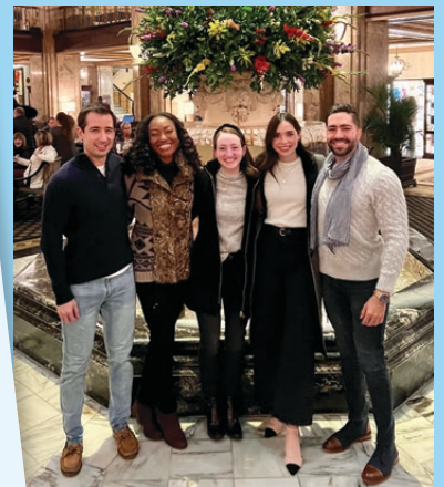
Resident Class of 2024