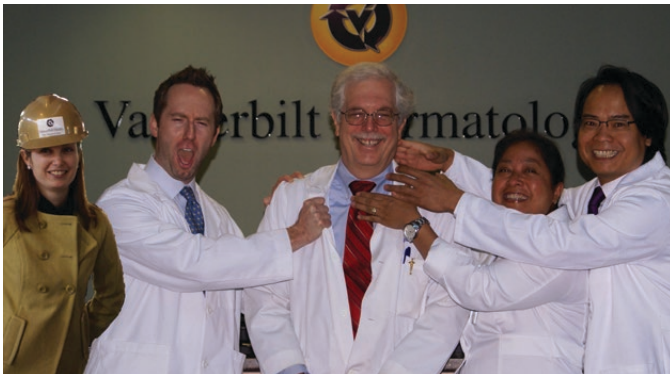
Vanderbilt Mohs Faculty Team, 2012